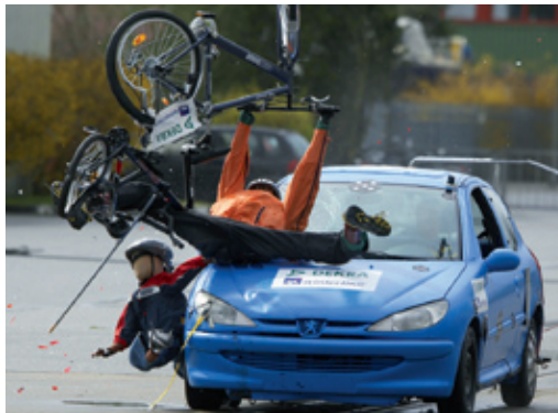
Research shows that children are probably the most vulnerable of all road users.

Skatebored? Adults accept that wearing a helmet and suitable padding provides essential protection when skateboarding on hard surfaces. Children may need to be convinced - that's up to us. Remember, as well as protecting against inevitable falls, they will also help if a skateboarder is hit by a slow speed vehicle or other board users. In other words, they could be a life saver.